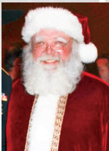
Santa courtesy of LV Premiere Entertainment